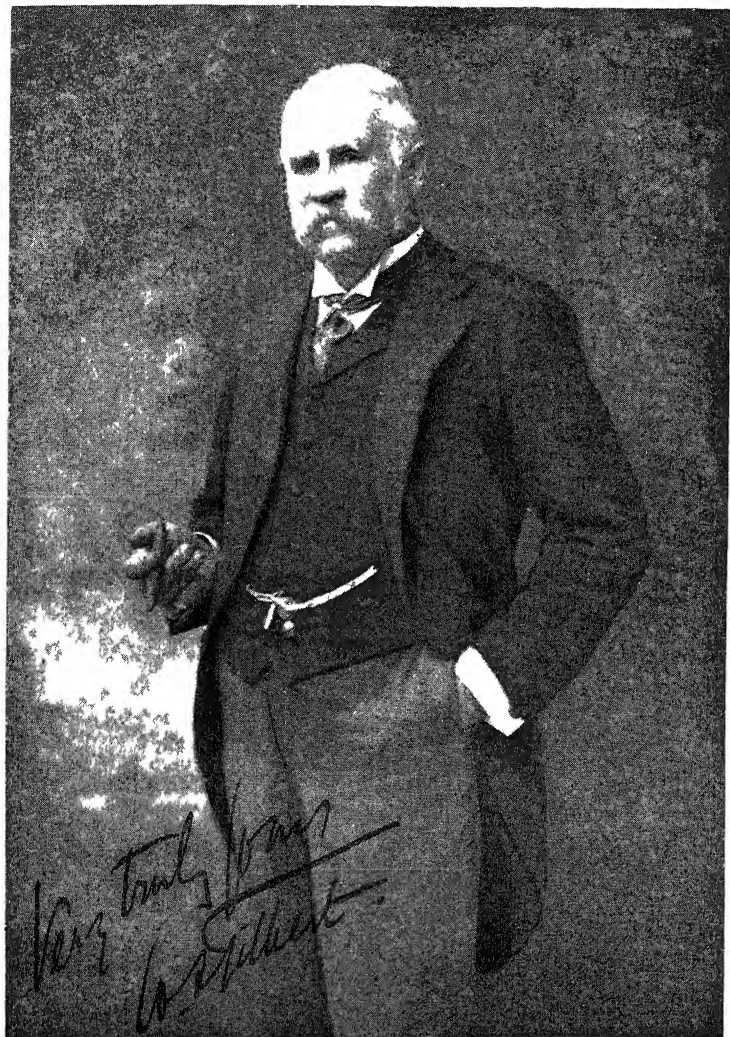
THE LATE SIR WILLIAM GILBERT